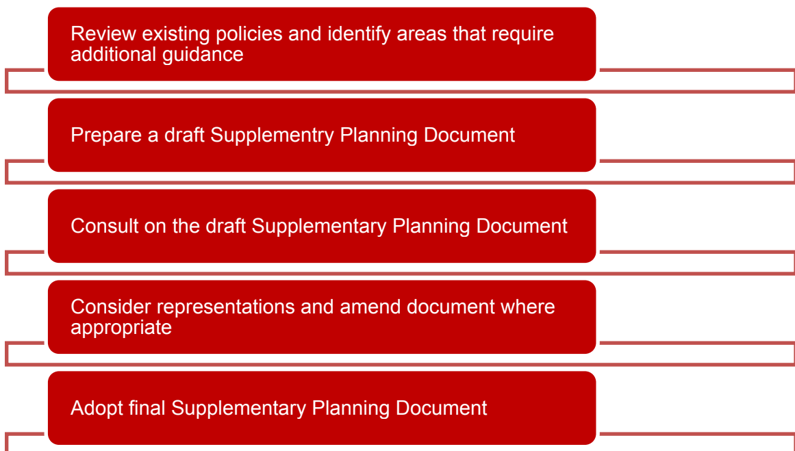
Figure 1 – Process for preparing a Supplementary Planning Document